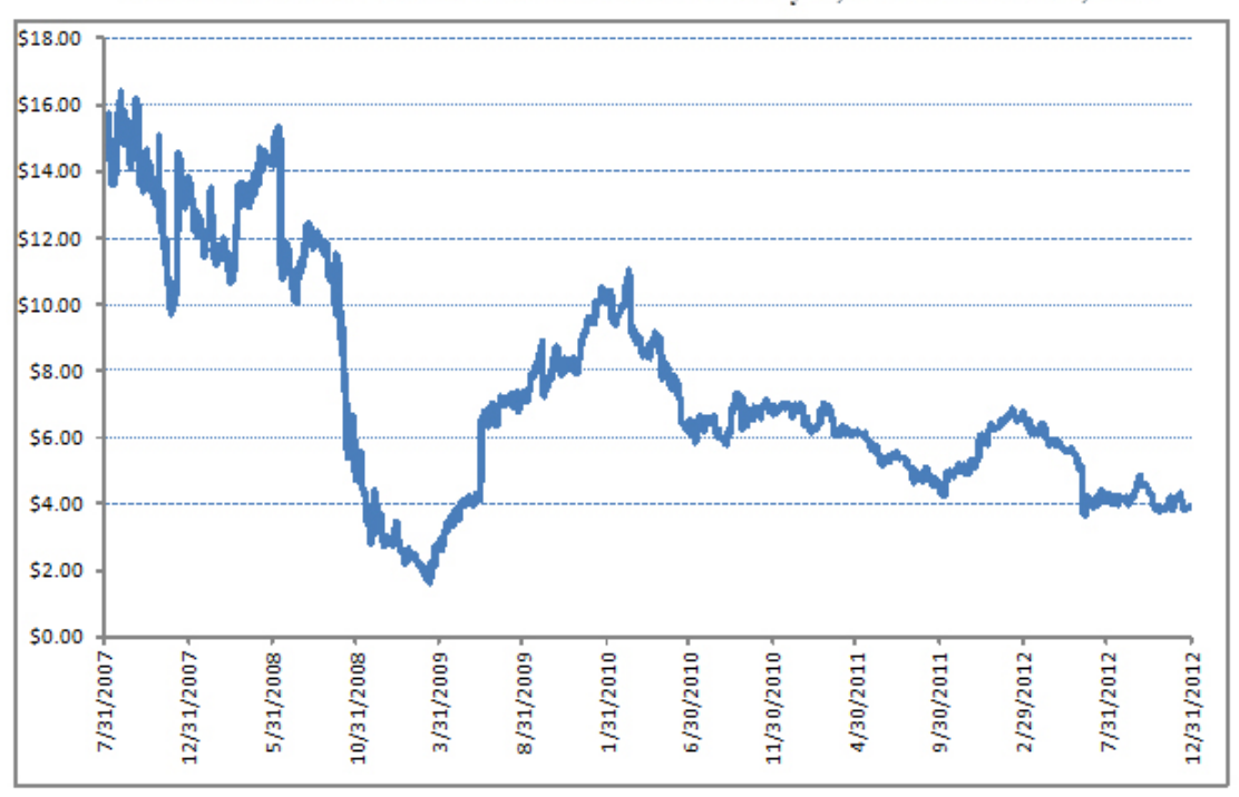
ModusLink's Historical Stock Price Performance From July 31, 2007 - December 21, 2012*